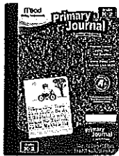
Mead primary Journal

A $15.00 instructional fee will be due on the day of Meet the Teacher. This fee is to cover instructional materials such as consumable workbooks, etc. that your child will use throughout the year.